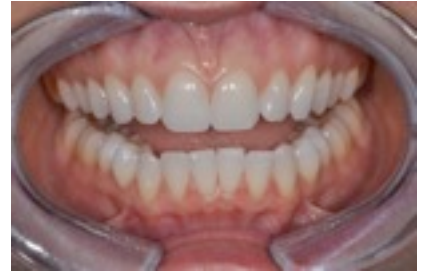
2:1 Retracted anterior (teeth apart)