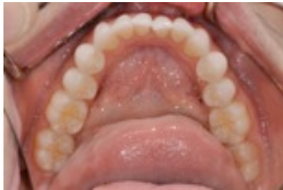
Mandibular Occlusal View