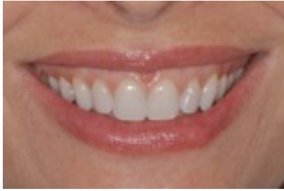
2:1 Anterior smile