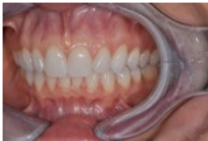
2:1 retracted lateral L (teeth together)