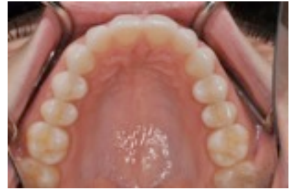
Maxillary Occlusal View