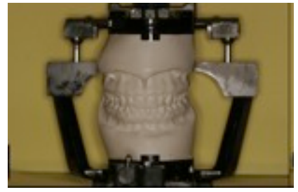
Mounted model Front