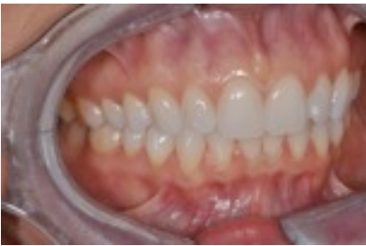
2:1 retracted lateral R (teeth together)